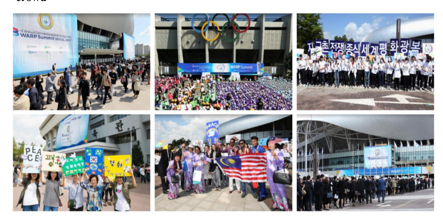
-people's expression : cheerful look etc